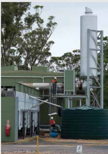
AGL's Camden Gas Project

Australian CSG producers have become international leaders in world-best practice technologies and production and the NSW Government has introduced some of the toughest regulations in the world to safeguard the health of communities and protect the State's valuable land and water resources.